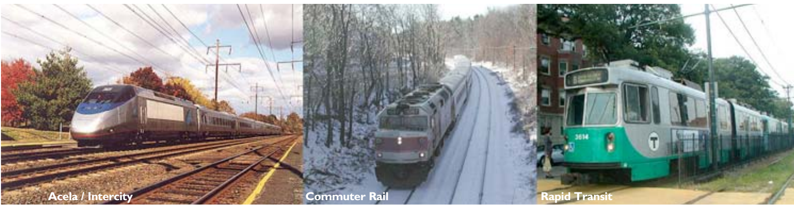
Acela / Intercity