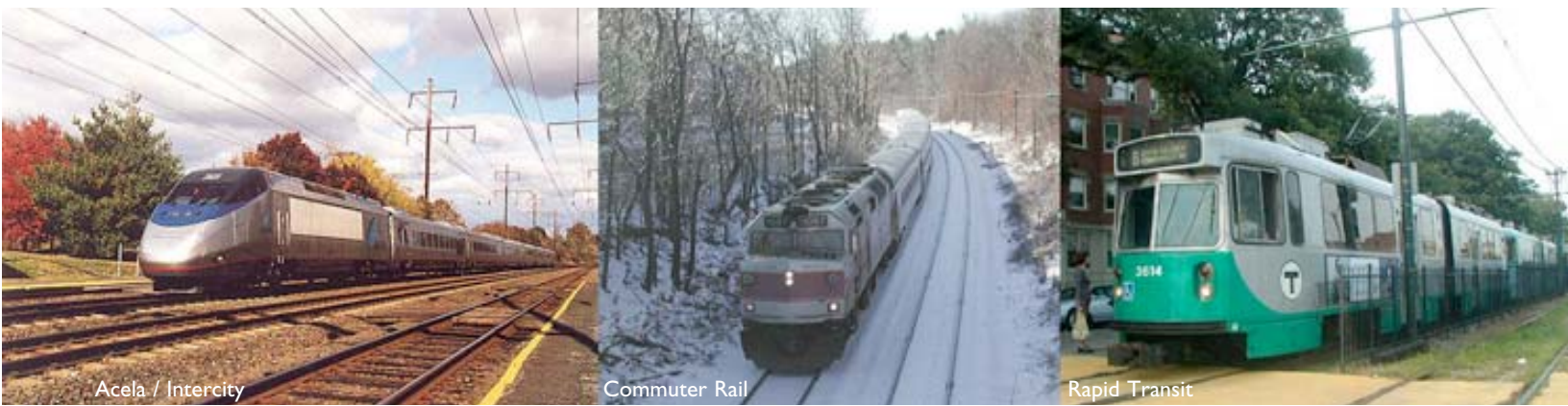
Acela / Intercity